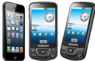
2 Mobile Extensions