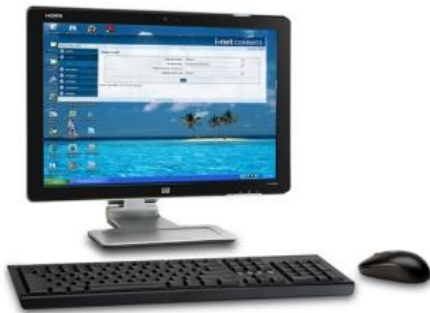
3 Web portal