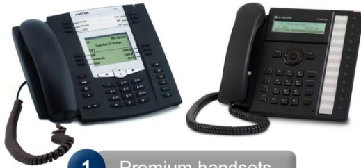
1 Premium handsets